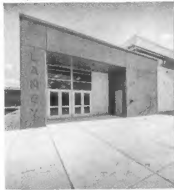
Laney High school, North Carolina